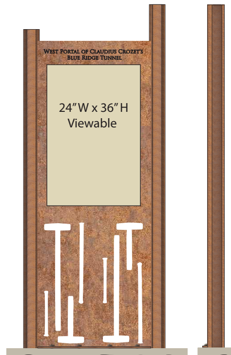
TUNNEL CONSTRUCTION INTERPRETIVE SIGN FRONT/SIDE ELEVATION